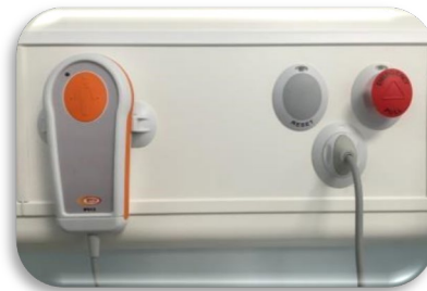
Nurse call bell system