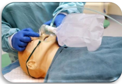
The hospital resuscitation station – manikin, bag valve mask