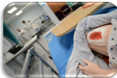
Aseptic non-touch technique station – example of a thigh wound