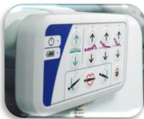
Electronic bed controls